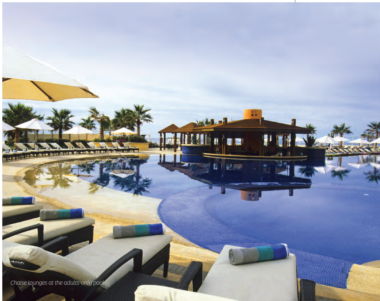
Chaise lounges at the adults-only pool

The newest getaway in Cabo San Lucas is the just-opened Towers at Pueblo Bonito Pacifica Golf & Spa Resort, with 47 luxurious new guest rooms and suites that have been added to the resort's existing property. An oasis in the middle of the sandy Mexican seaside, the Towers at Pacifica have beautiful views of the ocean and pool. Rooms feature deluxe bedding with a menu of different pillow types, wooden furniture, and metallic accents. The resort offers special experiences that are available to Tower guests, including a personal butler who can easily arrange every service, from an airport transfer to a dinner reservation. Hook & Cook is a hands-on experience that allows you to fish on the shore alongside chef Luis Gonzalez; he'll turn any fresh-caught fish into a sensational ceviche. Take a tour of the surrounding bay by boat and see the famous Arch of Cabo up close and personal, then jump in the water and snorkel with tropical fish. Enjoy a beachfront clam bake or get a lesson in stargazing. Prefer to chill poolside? You can do that, too, and order a round of spicy margaritas with the freshest, most scrumptious guacamole you'll ever taste.